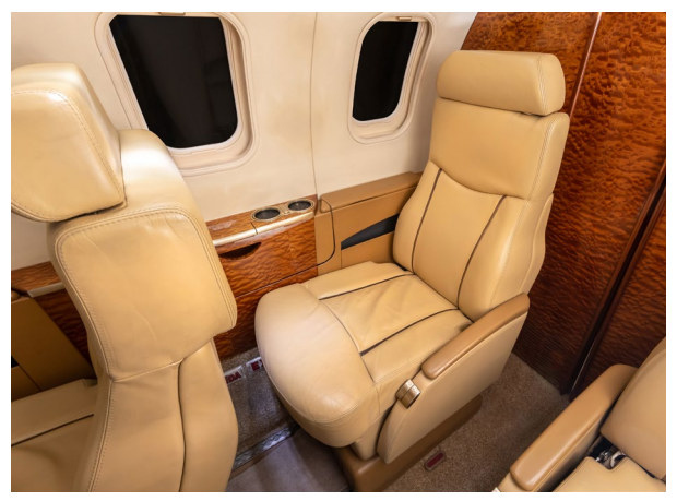
Specifications and/or descriptions are provided as introductory information only, and do not constitute representations or warranties of Pinnacle Aviation. Accordingly, you should rely on your own inspection of the aircraft. Subject to prior sale.